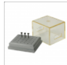
Steri Bur Blocks w/ Covers