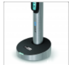
D-lux Cordless LED Curing Light