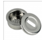
Germicide Bur Box